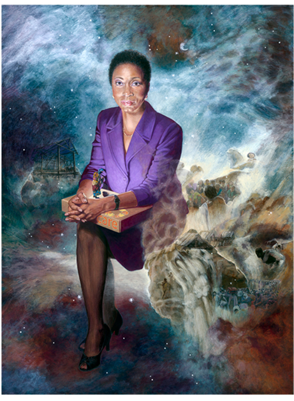
HELENE GAYLE Investing in Women

"We know women and girls have a unique power to reshape societies. When you invest in a woman's health and empowerment, it has a ripple effect, helping families, communities, and countries achieve long-lasting benefits."