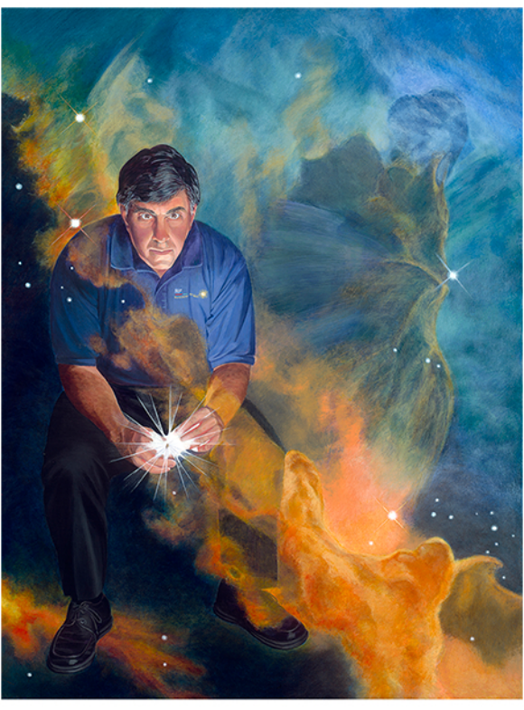
ED MOSES Bringing Star Power to Earth

Helene is African American and was born and raised in Buffalo, NY.